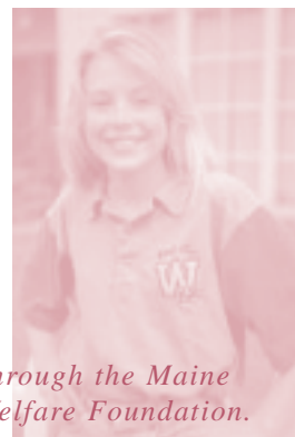
This publication was made possible by support from: The Robert Wood Johnson Foundation (through the Maine Covering Kids and Families Campaign); the Maine Health Access Foundation; and the Public Welfare Foundation.

NON-PROFIT ORG. U.S. POSTAGE PAID Augusta, Maine Permit No. 145